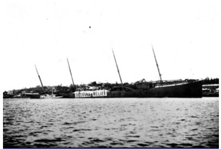
Figure 5. The SS Imo , post explosion, thrown against the Dartmouth-side of the Narrows.