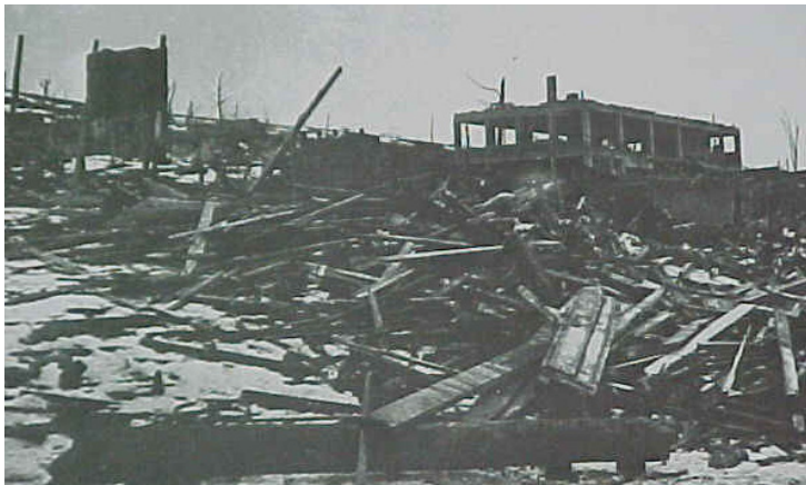
Figure 6. Ruins remained after the fires were put out.

Mont-Blanc's choice not to fly a red flag should have been corrected while entering the harbor. The Imo was unaware of the Mont-Blanc's cargo and confusion between signals while the ships steamed toward each other could have been met with caution if both Captain From and harbor pilot Hayes realized the nature of the Mont-Blanc's cargo. Rules required outbound harbor pilots for ships leaving Bedford Basin to alert port authorities, but no such notification from the Imo was known to have been made.