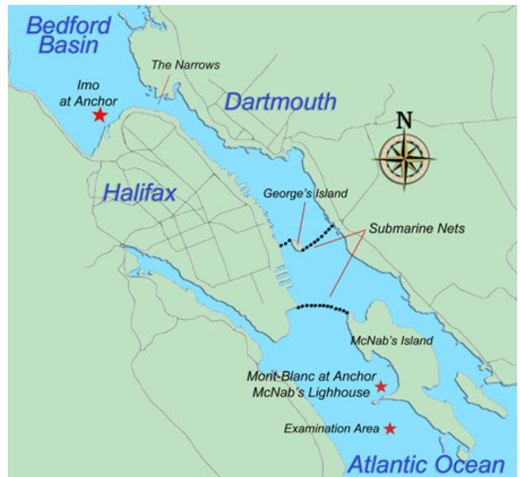
Figure 3. A map of Halifax Harbour.