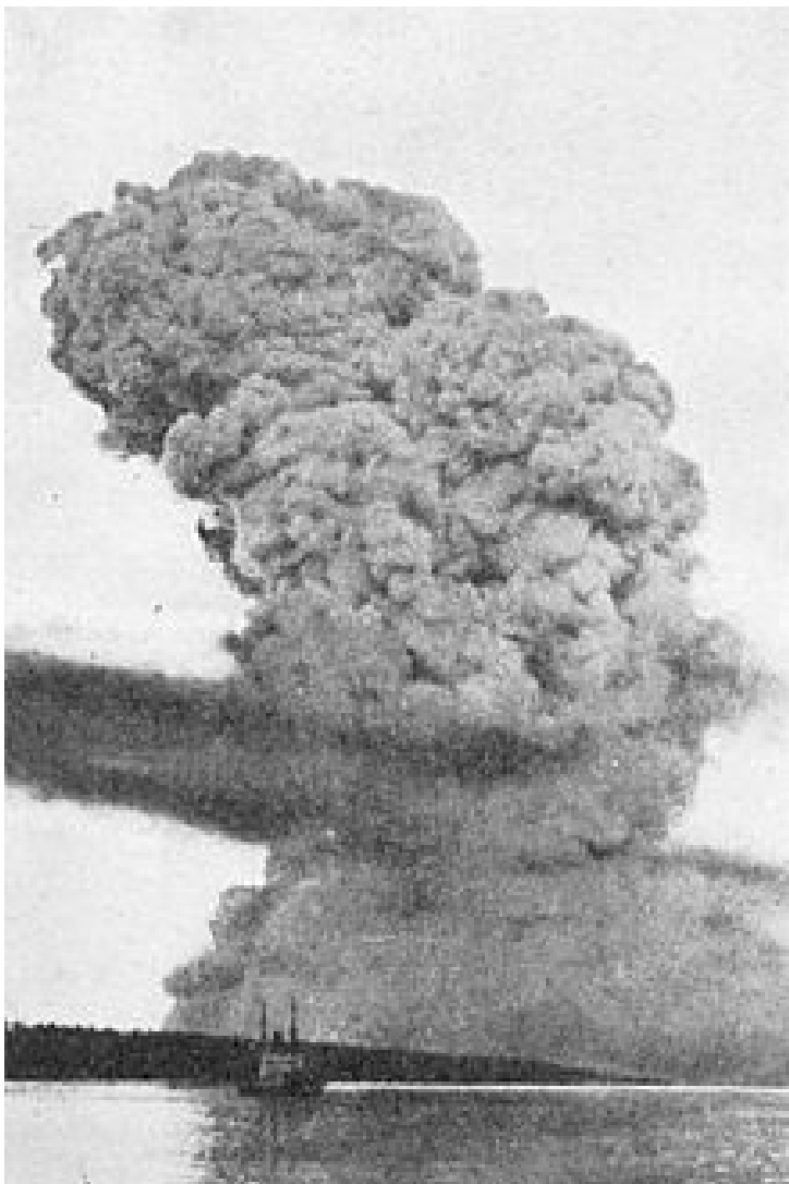
Figure 4. The cloud of smoke and debris from the explosion.

With two blasts, the Mont-Blanc turned hard to port, crossing the bow of the Imo , attempting to give the Imo room, but the Imo gave three blasts and ordered full reverse, torqueing right and crashing into the Mont-Blanc . Stacks of benzol barrels on the Mont-Blanc 's deck toppled and broke open, flooding the topside with flammable liquid. The grinding metal hulls showered the benzol with sparks, igniting the Mont-Blanc 's forward deck. Crowds flooded out of Halifax's buildings and gathered on the shores to watch the spectacle as more barrels exploded. No spectators knew what the Mont-Blanc carried—and there were scant minutes to spread the word for those who were aware of the cargo. The captain of the Mont-Blanc ordered the crew to abandon ship. The Imo , unable to maneuver back to the basin, made for sea.