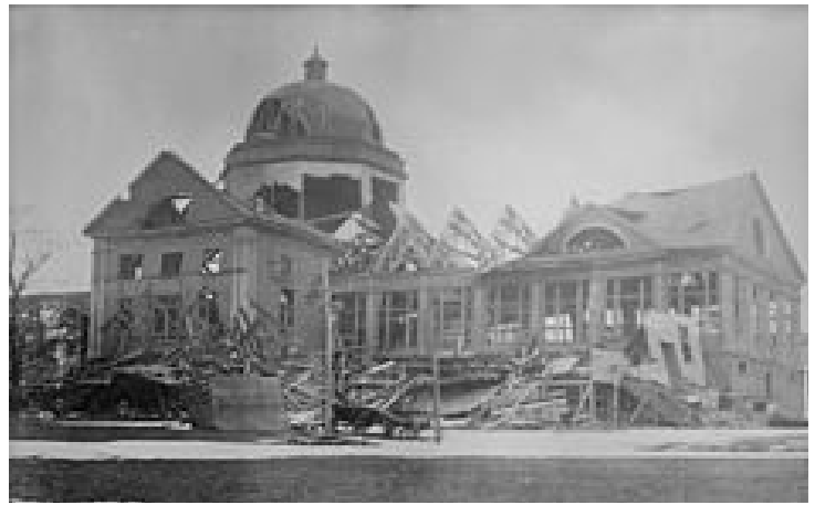
Figure 7. An example of one of Halifax's more resilient structures farther away from the blast.

Those with authority to delay the vessel further lacked the information to do so.