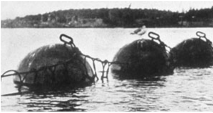
Figure 1. Submarine nets consisted of chain gates weighted by concrete at the bottom and supported by buoys.

a feature that also makes the harbor easily defensible, especially important considering U-boat threats. Newly invented chain link anti-submarine nets could be rigged across the Narrows to further bolster harbor defenses.